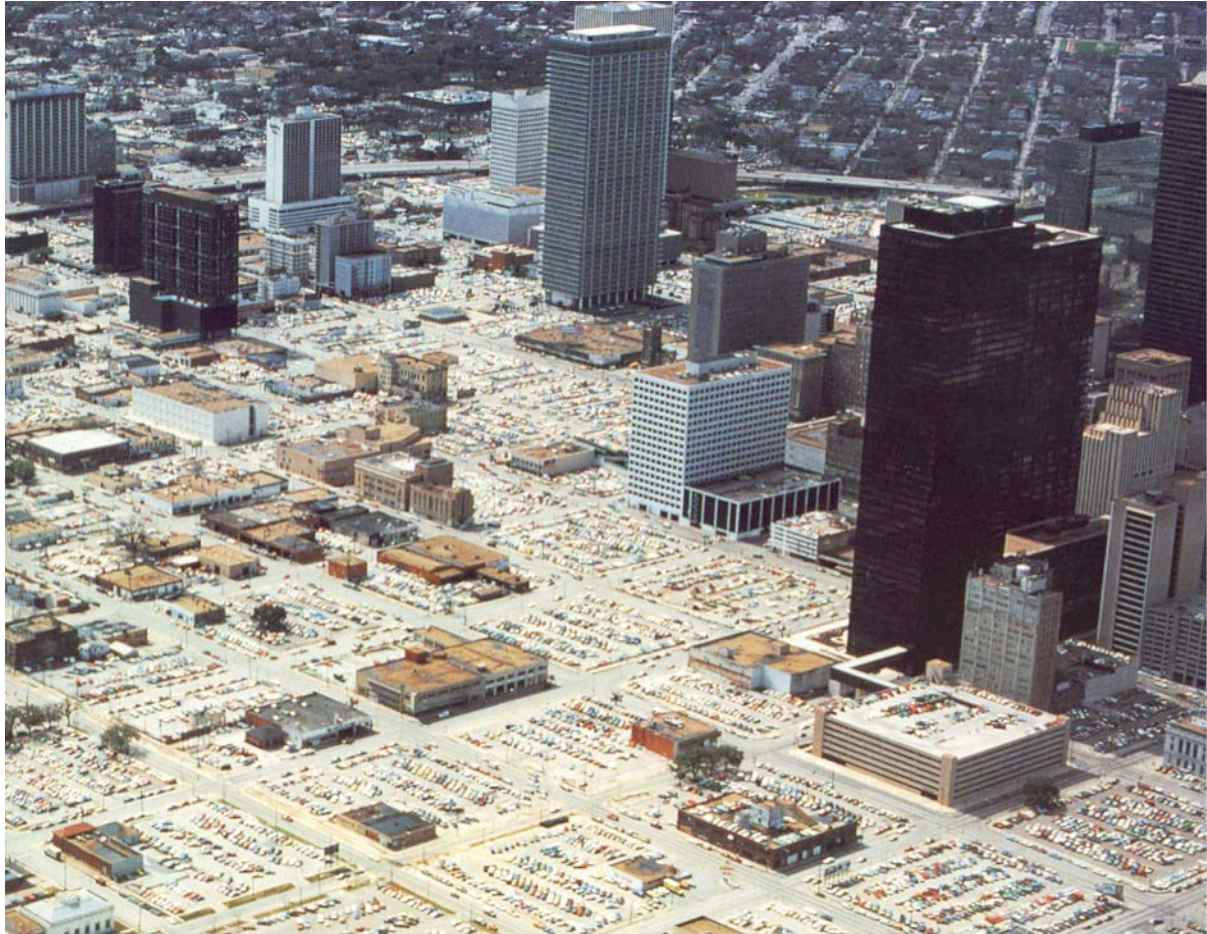
Detroit, 1980s. Source: Plate 39 from The City Assembled: The Elements of Urban Form Through History , Spiro Kostoff, 1992.

Litman (2009, p.1-14) notes that increased urban roadway capacity is likely to stimulate low-density, urban-fringe, car dependent development patterns. Its effect is to reduce urban densities . Other types of transport improvements usually result in more infill and clustered land use.